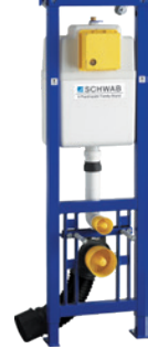
DUPLO WC 380 VARIO