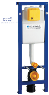
DUPLO WC 380 IN.CON. 16x2 112cm